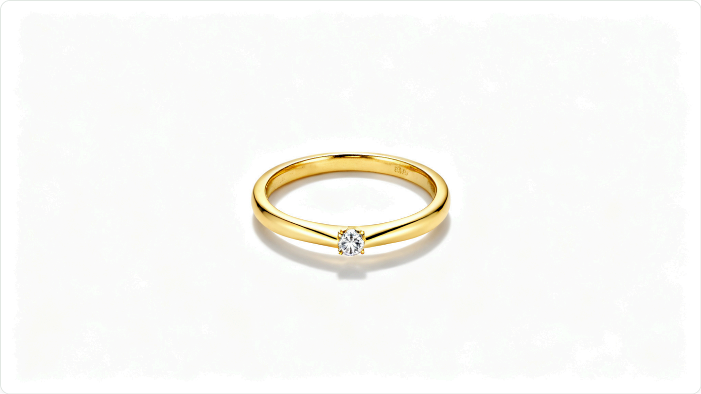
White-background main – the marketplace hero shot