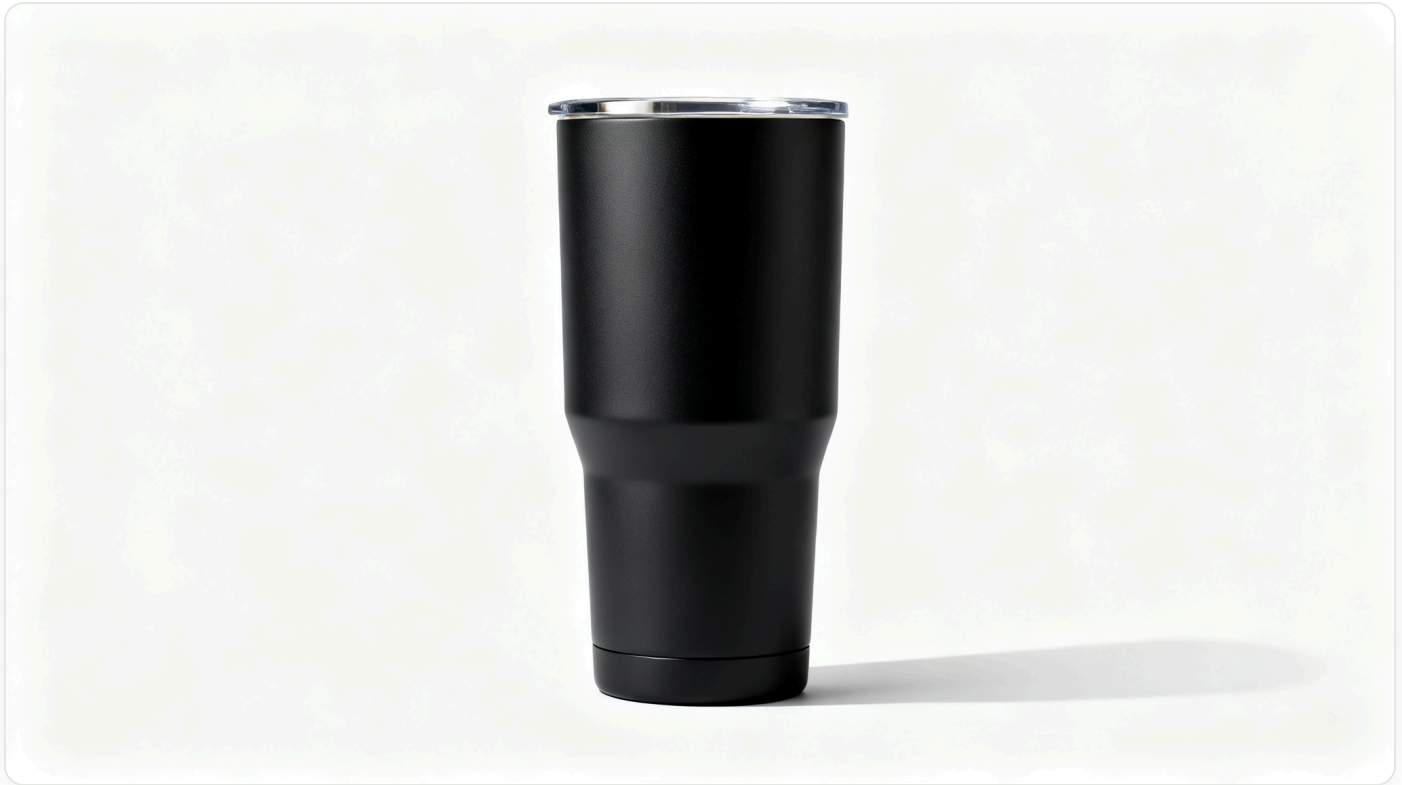
White-background main – the marketplace hero shot