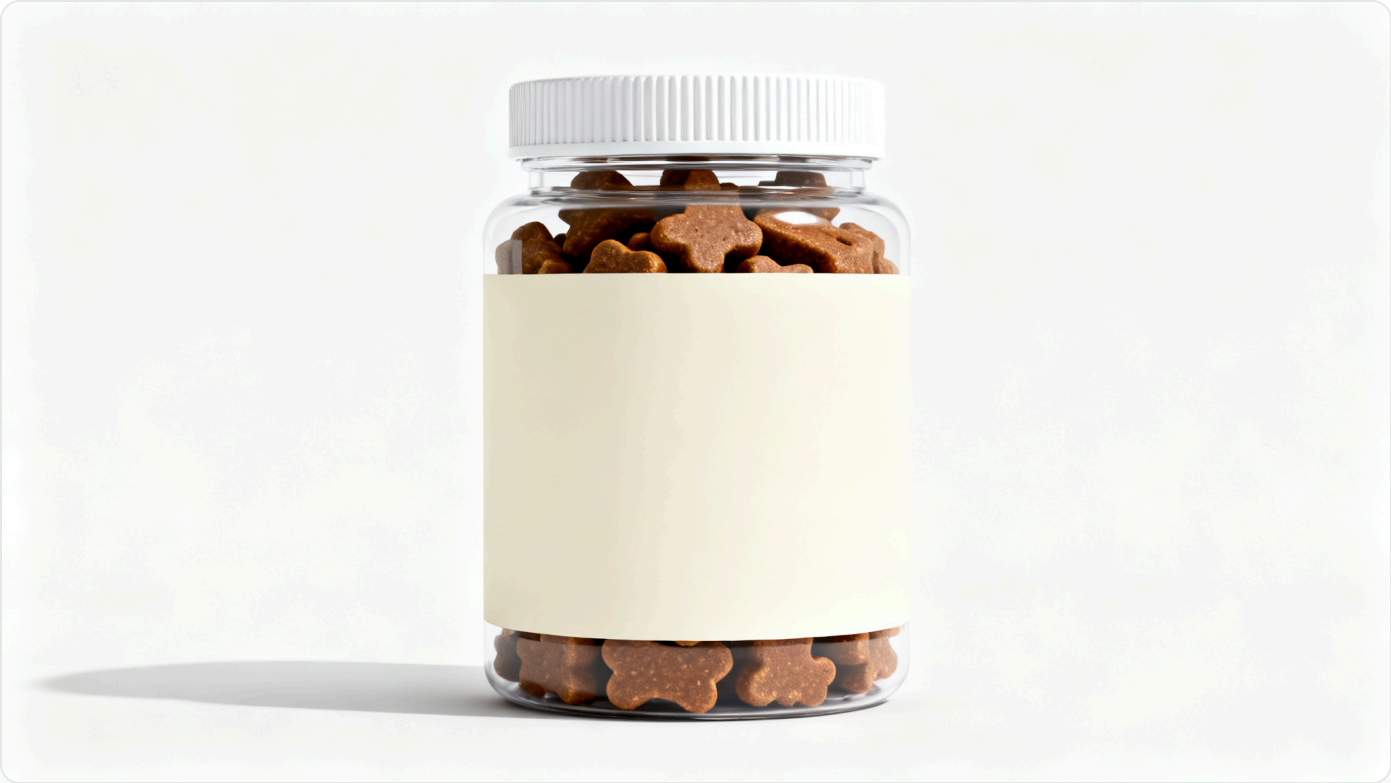
White-background main – the marketplace hero shot