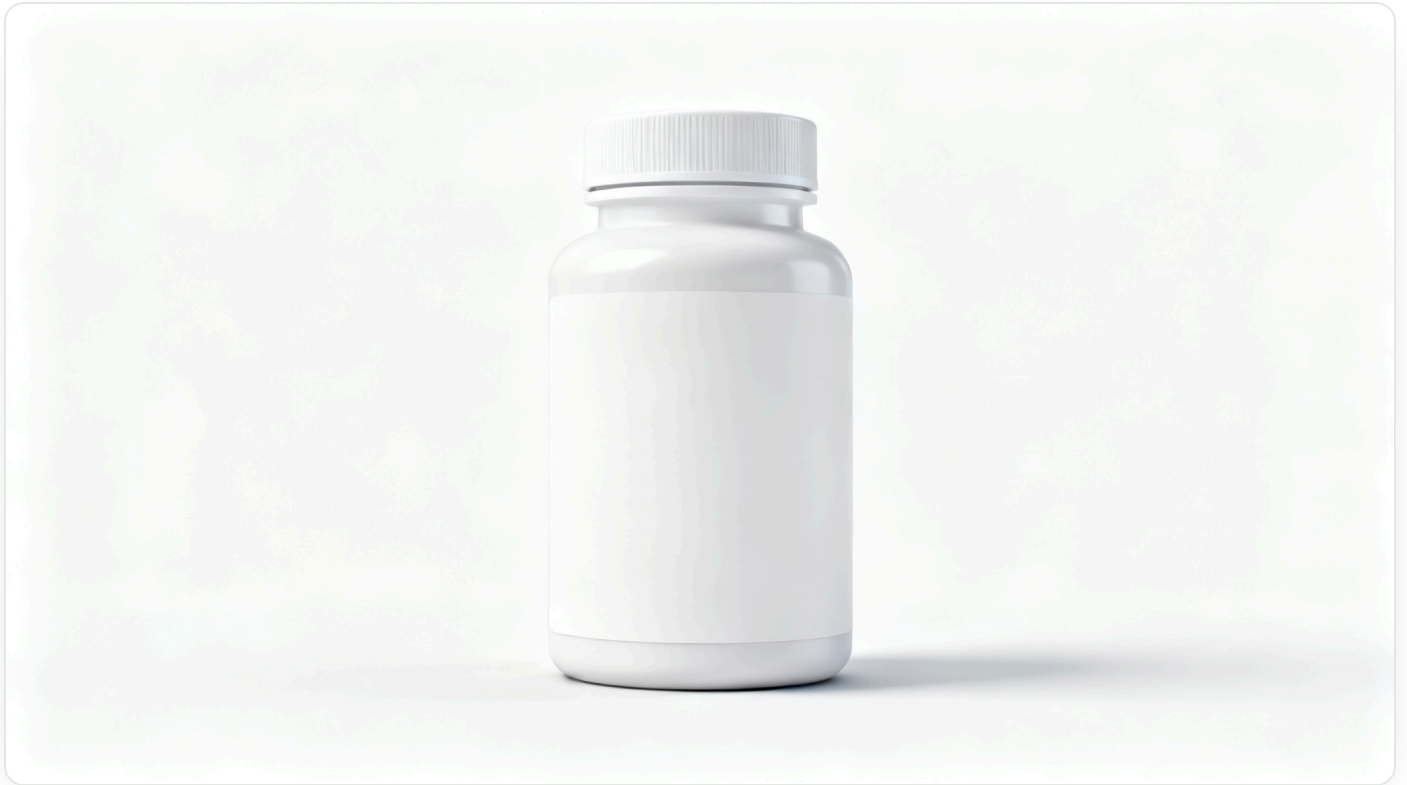
White-background main – the marketplace hero shot