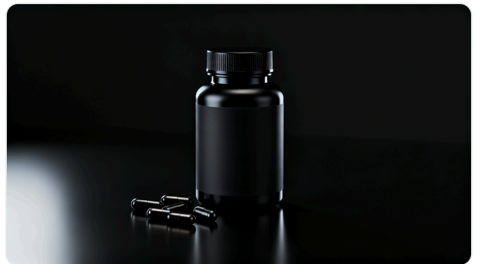
EDITORIAL / HERO