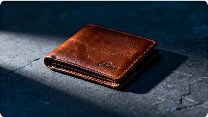
EDITORIAL / HERO