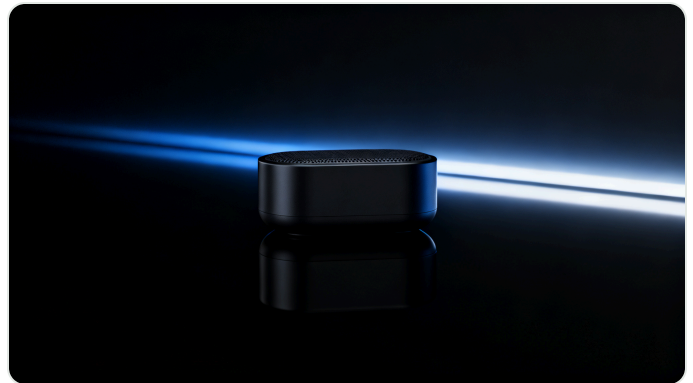
EDITORIAL / HERO