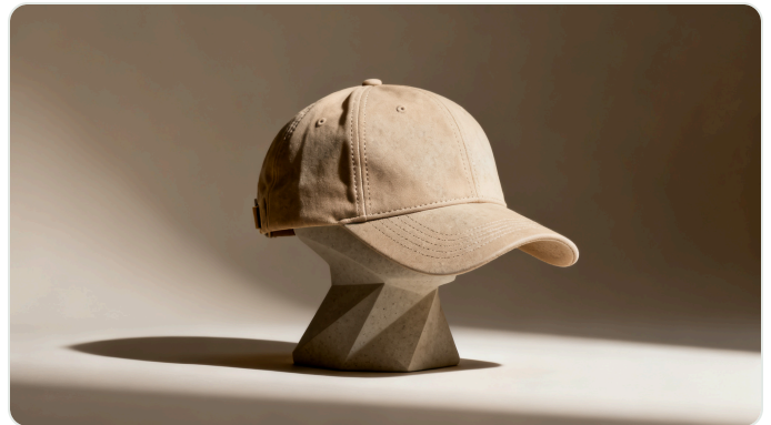
EDITORIAL / HERO