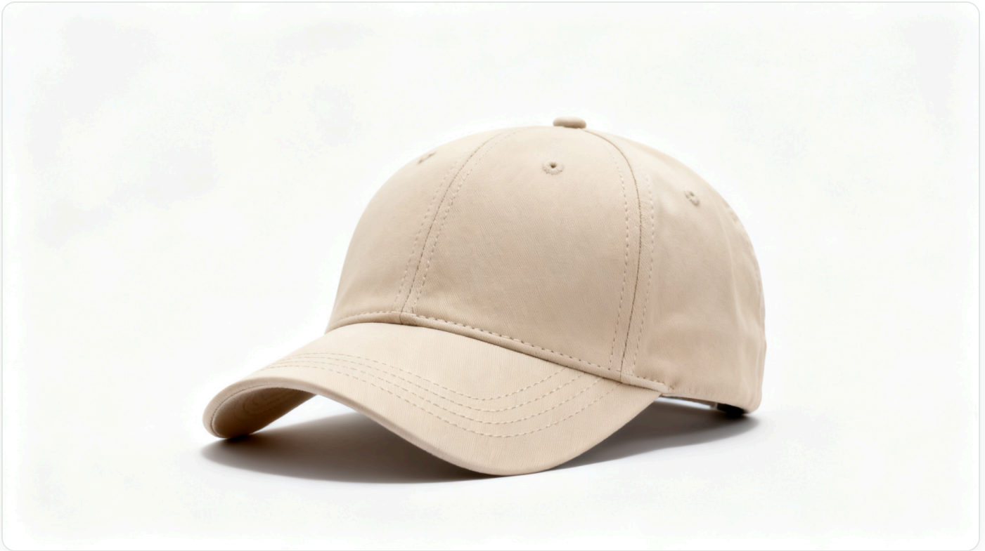
White-background main – the marketplace hero shot