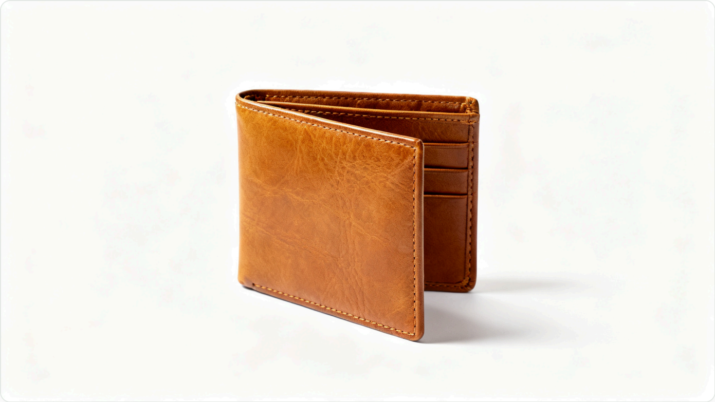
White-background main – the marketplace hero shot