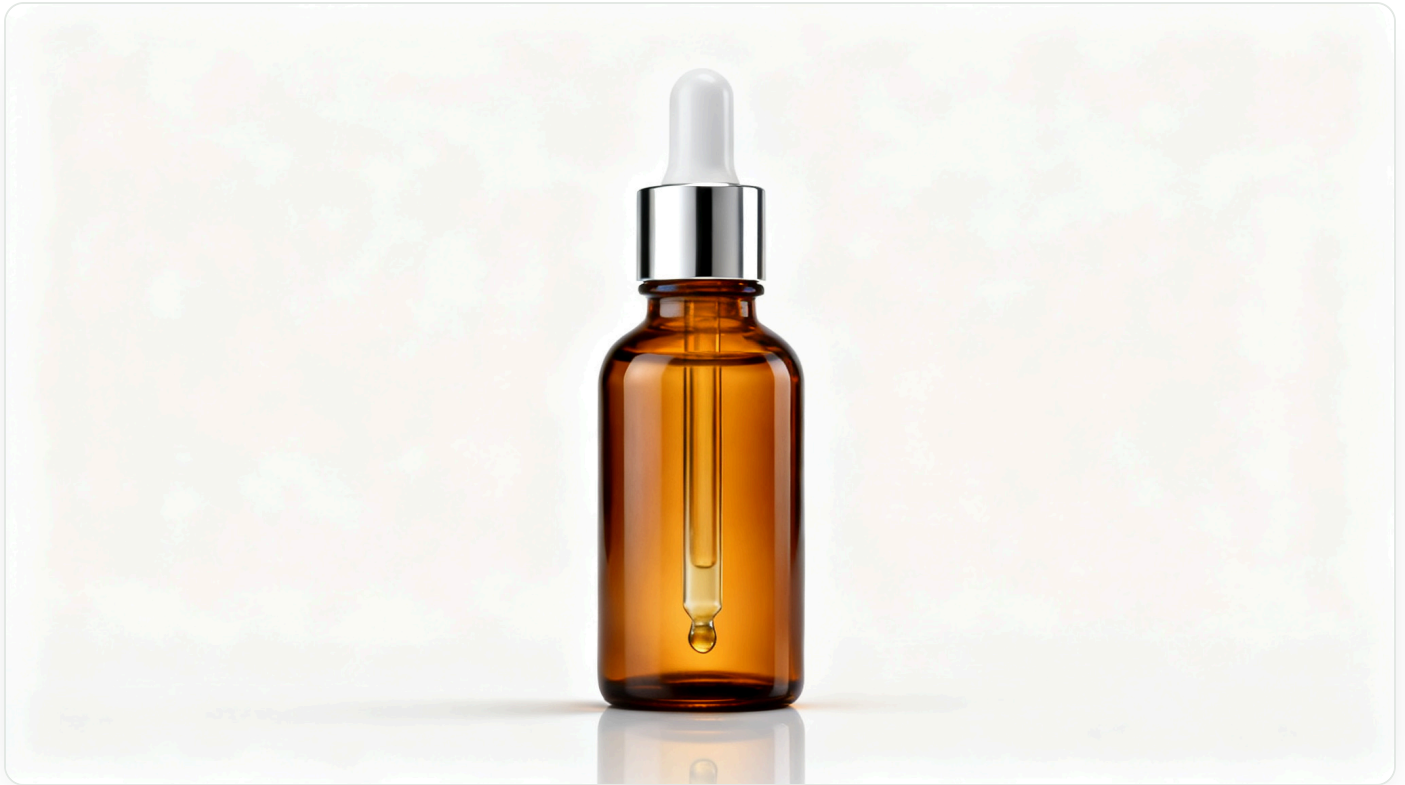
White-background main – the marketplace hero shot