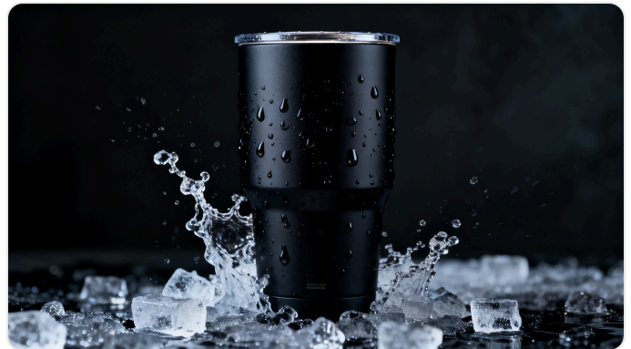
EDITORIAL / HERO