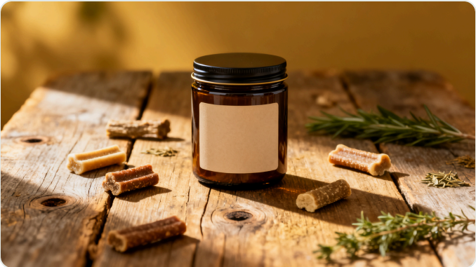
EDITORIAL / HERO