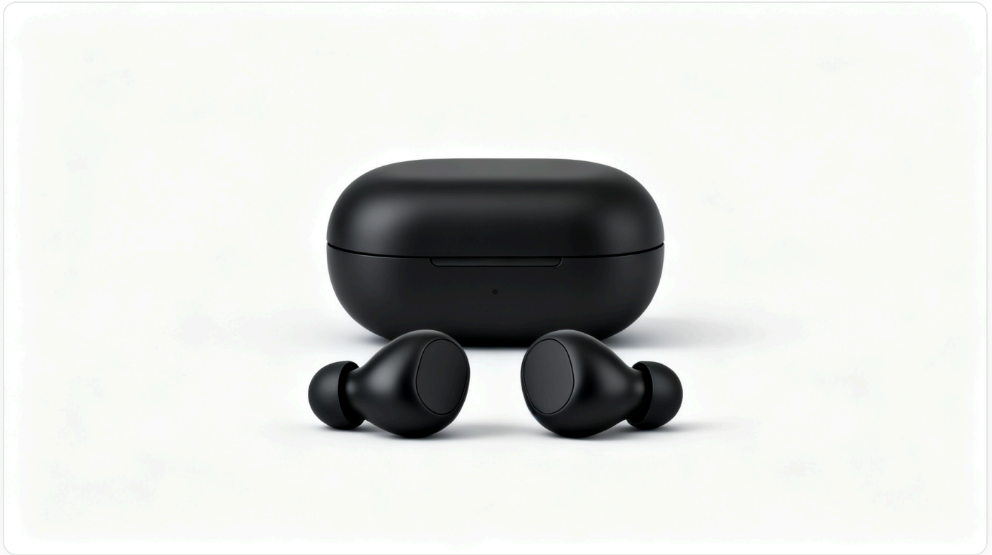
White-background main – the marketplace hero shot